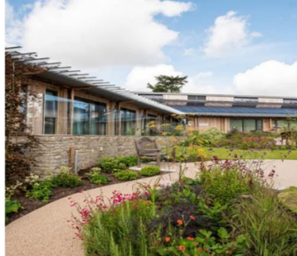
P4 LIFE AT ST PETER'S HOSPICE