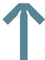
P9 PATIENT AND FAMILY SUPPORT