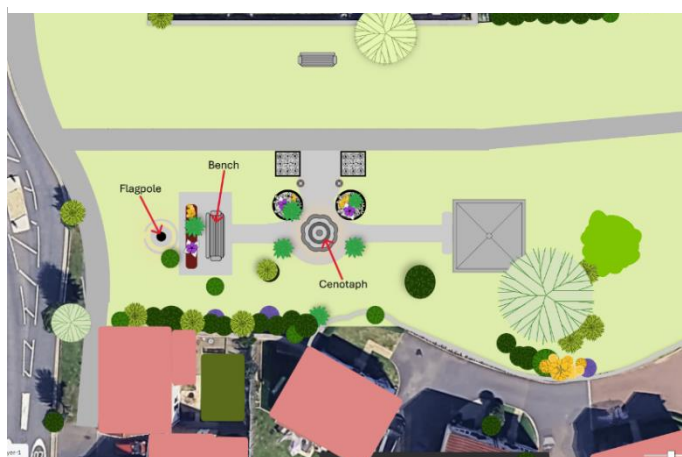
Fig 2. Approximate design draft. Not to scale

The planting beds, located closer to the walled area, will help mitigate waterlogging and attract pollinators, enhancing the local ecosystem. The few established trees currently on the site will remain undisturbed, and any new additions will be sensitively selected to compliment and blend with the existing landscape.